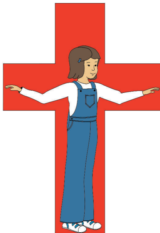
© 2003, Butterfly Park Educational Materials, Inc.