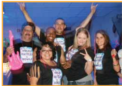
North Range Behavioral Health

The United Way Pacesetter companies kicked off the Community Wide Campaign with Rock and Roll Bowling. Dressed in the most unique and inventive costumes the participants made commitments that their companies would lead the way and set the employee campaign "pace" for others to follow.