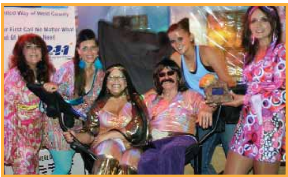
National Board of Chiropractic Examiners

The United Way Pacesetter companies kicked off the Community Wide Campaign with Rock and Roll Bowling. Dressed in the most unique and inventive costumes the participants made commitments that their companies would lead the way and set the employee campaign "pace" for others to follow.