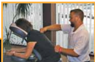
United Way Staff members enjoying complimentary chair massages.