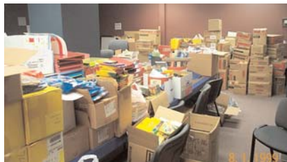
The 2007 School Supply Drive fills a meeting room at the United Way office.

The United Way School Supply Drive is an excellent example of how the Gifts In Kind Program benefits our community. The tenth of August found the United Way building buzzing with recipients of brand new school supplies to be distributed to children in need.