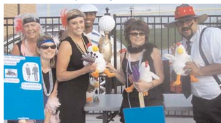
North Range Behavioral Health/Northeast Behavioral Health, winners of the Pacesetter Kickoff Spirit Award.

RR Donnelley Norwest, Inc. Sears Real Estate The Greeley Tribune United Colony Bank-Main Branch United Way of Weld County Weld County Garage